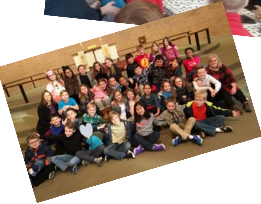
Third grade led chapel on January 17 and taught everyone a lesson on salt and how it relates to our life as Christians!